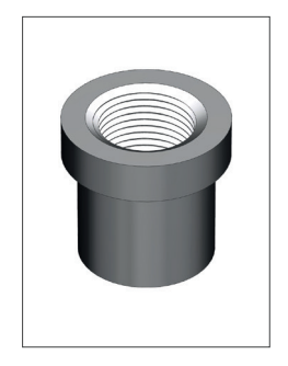
G 1/8"F perimetral fitting for water level probe