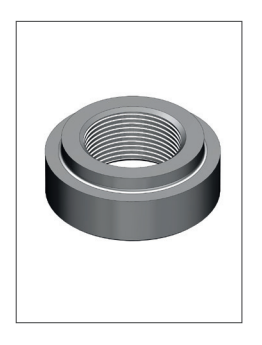
G 1/8"F perimetral fitting

Should the configuration contain one of more fittings for water level probe, the probe itself can be selected in the following steps.