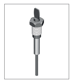
Water level probe

The user can option up to two probes, for single-probe or multi-probe applications. While the first provides information as water level is low, the second can be used to stop the refill. Probes are provided of the same length (147mm), bundled in a separated plastic bag. The user will decide which one to use as "refill-stop probe" by cutting the excess of the chosen one. Herewith suggested lengths for each boiler capacity: