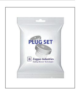
Dummy plug set

Caps are bundled in a separated plastic bag.