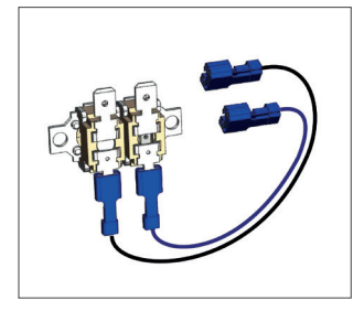
Manual reset cut-off thermostat

Optional thermostat includes the cables connection to the power terminals of the boiler. Both phases of the heater are protected by the thermostat.